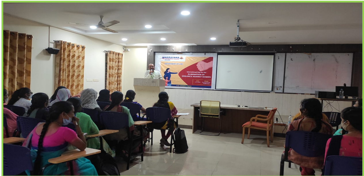
Students listening enthusiastically